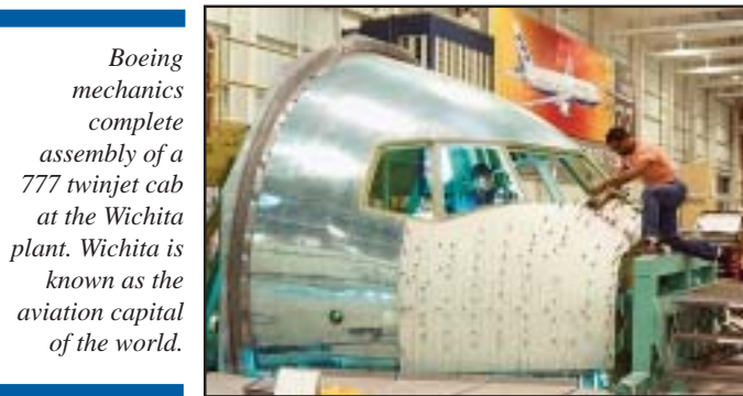
Boeing mechanics complete assembly of a 777 twinjet cab at the Wichita plant. Wichita is known as the aviation capital of the world.

Kansas ranks second in beef processing and production and third in the producers of red meat in the United States. Kansas has 34,000 farms with cattle and calves.