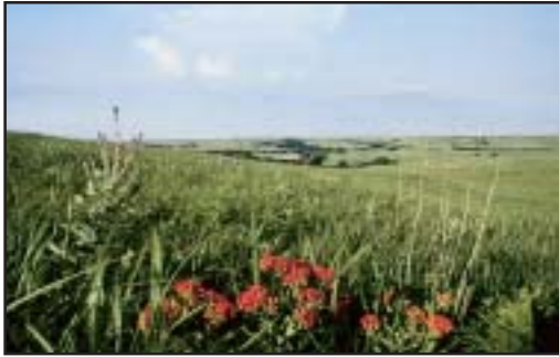
KANSAS TRAVEL & TOURISM

The Flint Hills, located in east-central Kansas, is the largest remaining tallgrass prairie in the United States covering more than five million acres.