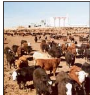
KANSAS BEEF COUNCIL