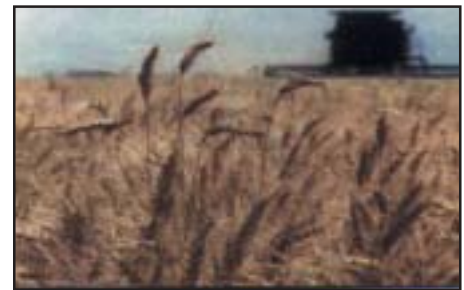
KANSAS WHEAT COMMISSION

Kansas is the world leader in the production of general aviation aircraft, with more than 30,000 workers employed by four major aerospace companies. Starting in 1917—and continuing through World War I—Clyde Cessna (Cessna Aircraft Company), Lloyd Stearman (Boeing Business Jets), Walter Beech (Raytheon Aircraft), and Bill Lear (Bombardier Aerospace-Learjet) began building aircraft in Wichita. Today, over half of the world's general aviation aircraft are manufactured in Kansas. Boeing, the world's largest aerospace company, has major commercial and military operations in Wichita, Kansas.