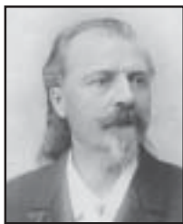
"Buffalo Bill" Cody

During the "cattle town" days in Kansas, several lawmen in the state gained national fame. James Butler "Wild Bill" Hickok was active in Kansas in the 1860s and 1870s, serving part of that time as city marshal in the cattle town of Abilene. Wyatt Earp served as a lawman in Wichita and Dodge City during the 1870s. "Bat" Masterson served during the same era as Sheriff of Ford County, where Dodge City is located. William Frederick ("Buffalo Bill") Cody earned his nickname while hunting buffalo to supply meat to laborers on the Kansas Pacific Railroad. Cody, an Indian scout and Pony Express rider, lived much of his life in Kansas.