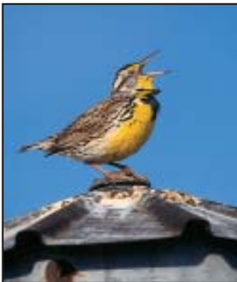
DEPT. OF WILDLIFE & PARKS