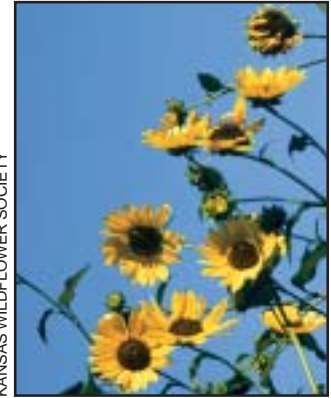
KANSAS WILDFLOWER SOCIETY