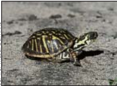
DEPT. OF WILDLIFE & PARKS