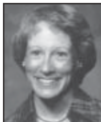
Nancy Kassebaum Baker

In 1978, Kansas elected its first female U.S. Senator. Nancy Kassebaum Baker , daughter of former Kansas governor and 1936 presidential nominee Alf Landon, became the first female from any state to be elected in her own right to a full term in the U.S. Senate.